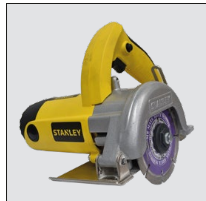
Cutting Machine With 2mm Blade