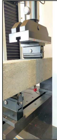
BS EN 14651 Setup