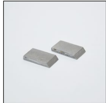
Datum Pieces With Sharp Edge