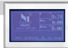
Main Screen Display