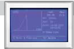
Retrieving Sample Result with Graph Display