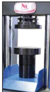
Mortar Compression Jig